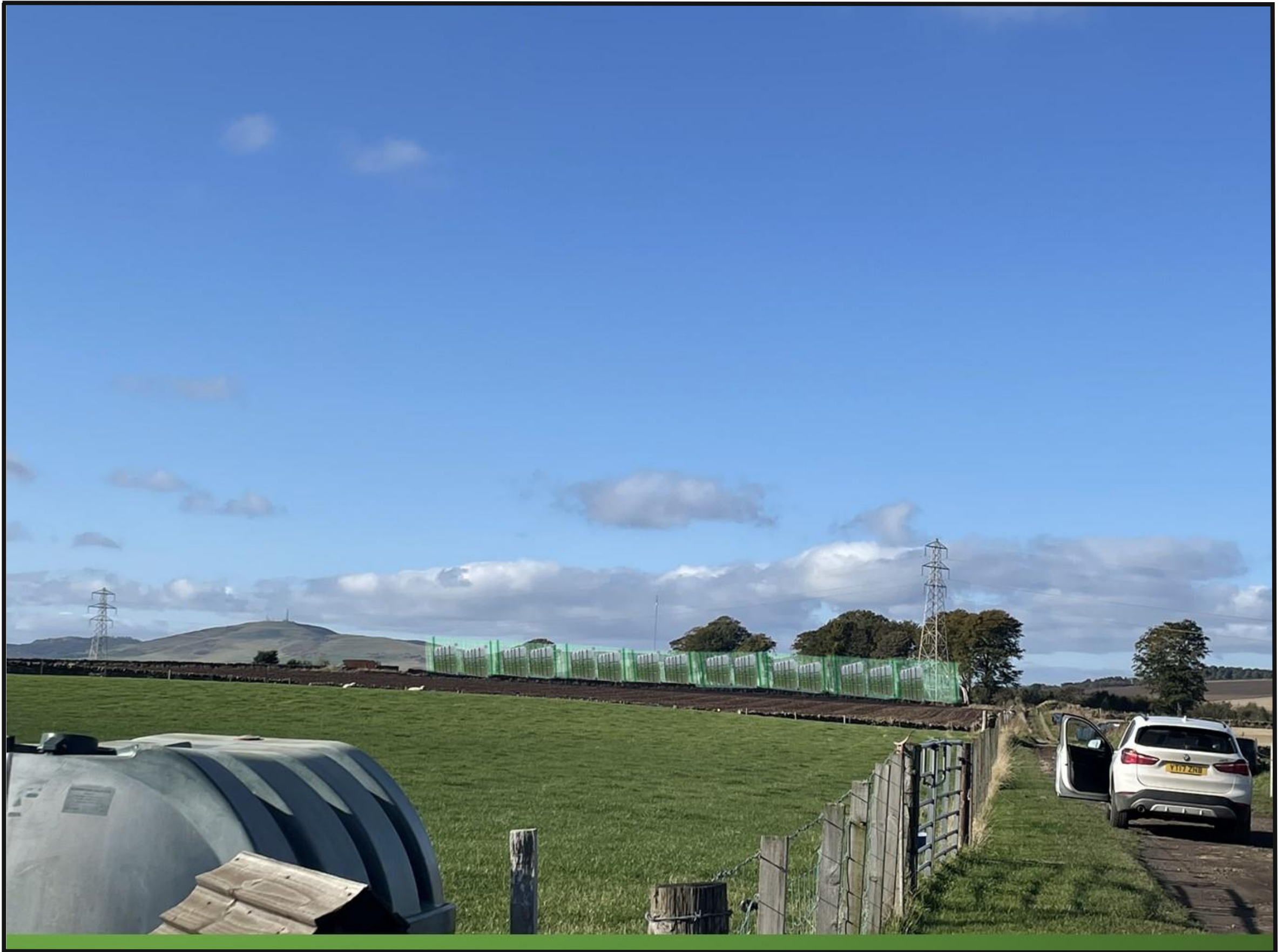
PROPOSED VIEWPOINT FROM YEAR 1 WITH NO ESTABLISHED VEGETATION SCREENING