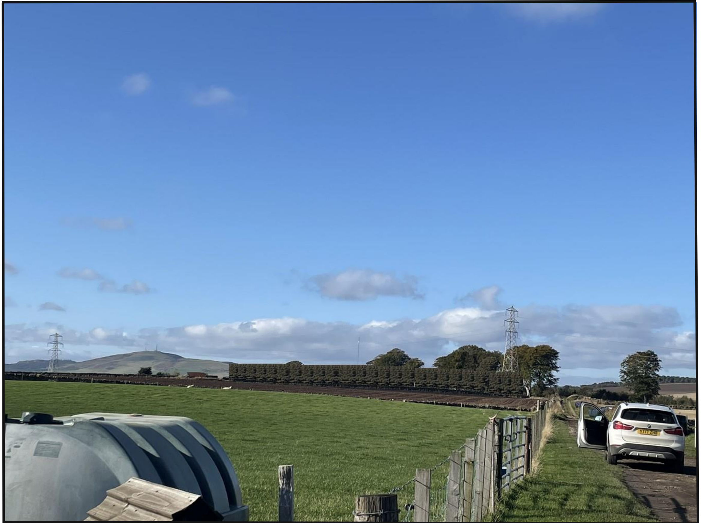
PROPOSED VIEW WITH FULL SCREENING OVER 5 - 10 YEARS