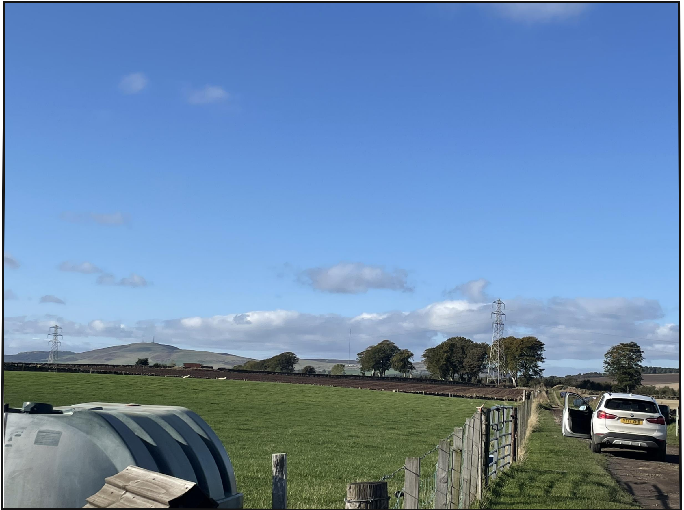
EXISTING VIEW FROM THE LARCH RESIDENTIAL PROPERTY. VIEWPOINT POSITION 345625 737998 401m DISTANCE