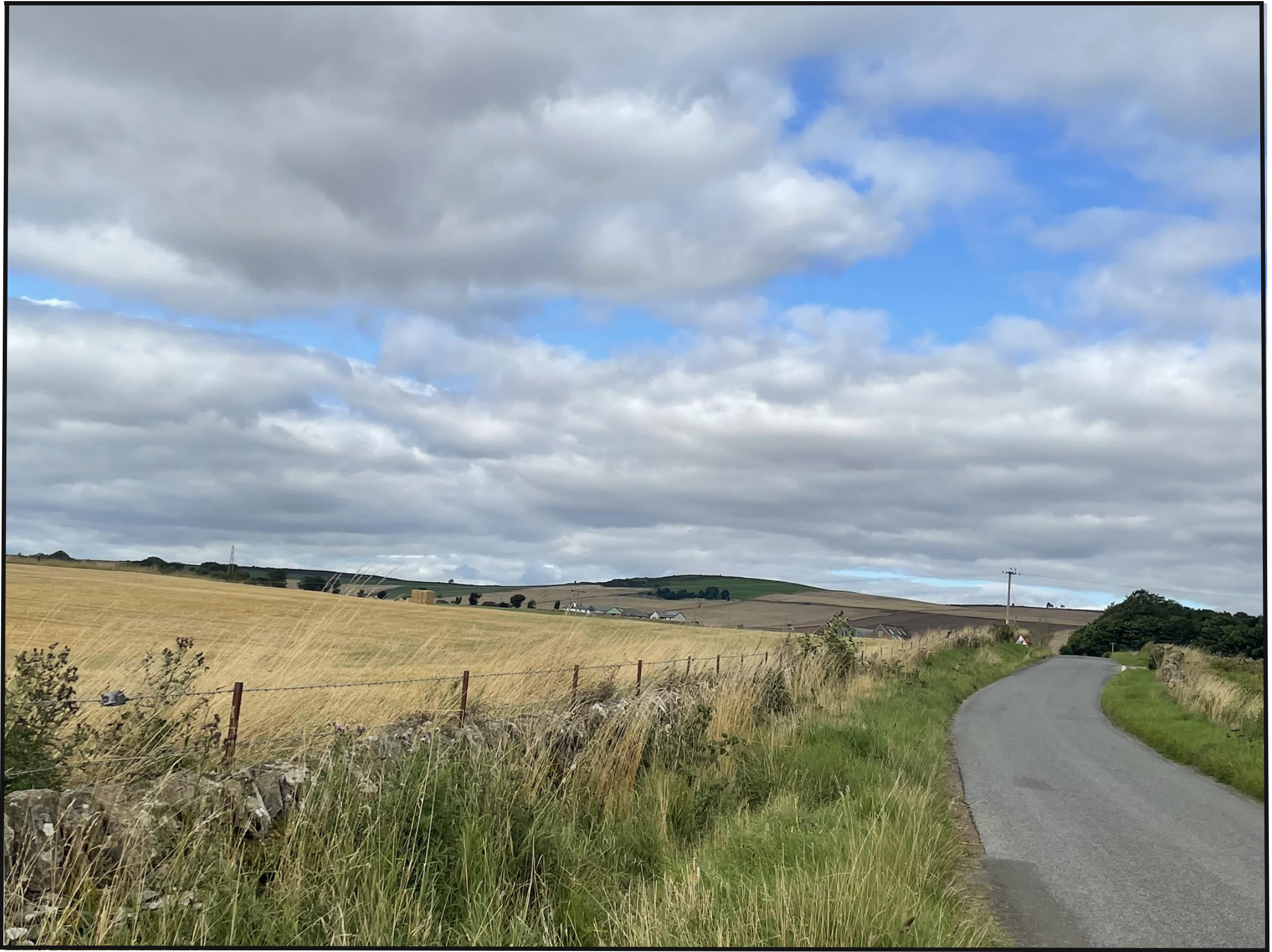
EXISTING VIEWPOINT FROM LAYBY ON CHAPEL ROAD