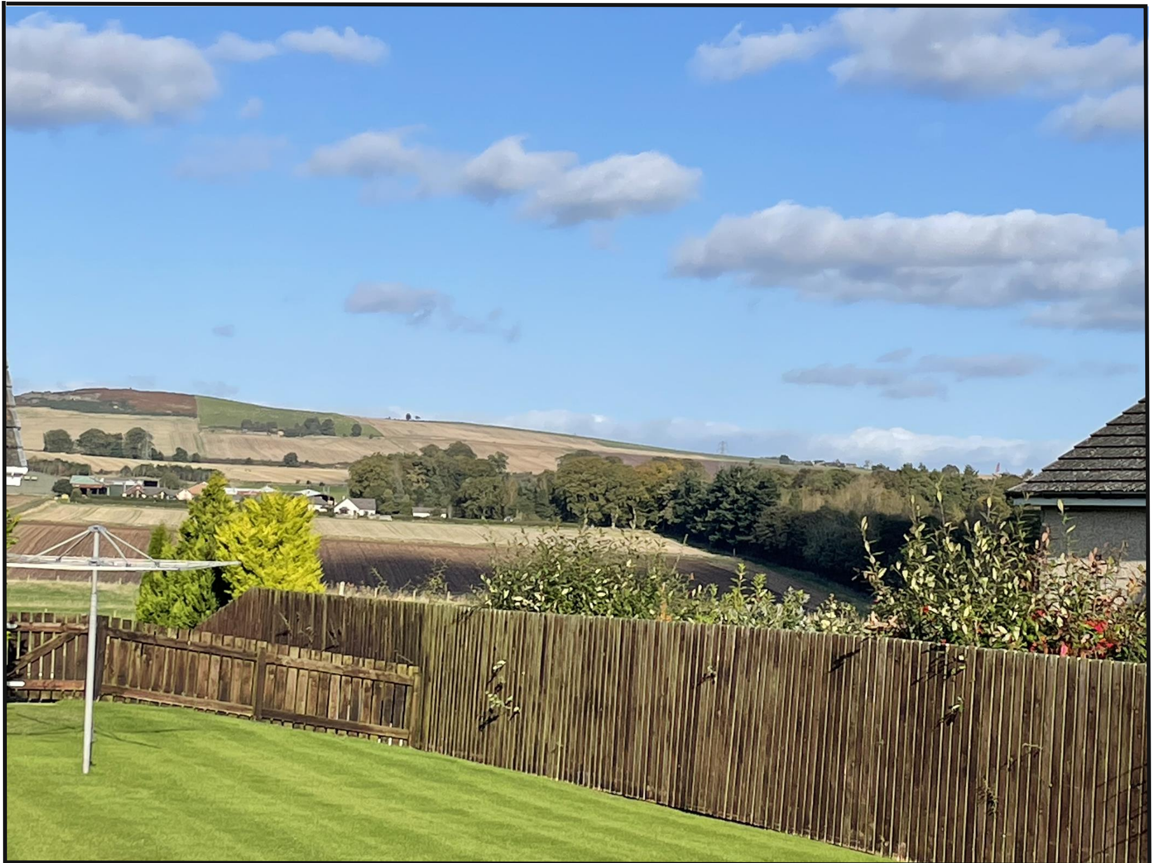
EXISTING VIEWPOINT FROM CARPARK AREA OF VILLAGE HALL IN DUNTRUNE